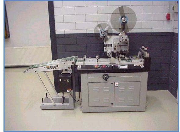
The Kirk Rudy KR535 Tabbing System with the Kirk Rudy KR411 Interface Conveyor